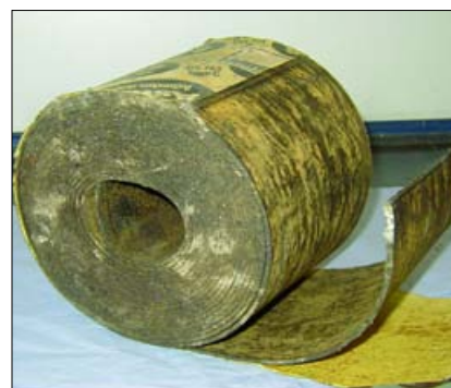
Floor tiles that contain asbestos can also have asbestos-paper backing, or be fixed with asbestos-containing mastic